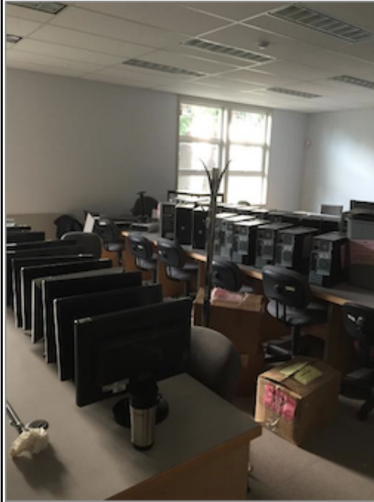
Neatly lined up, just waiting for some power.....